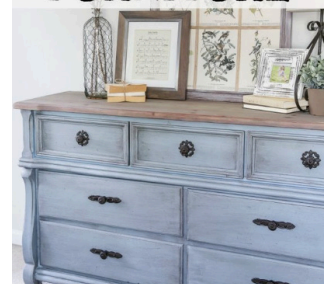
Above are examples of helpful tips you'll find on Habitat's Pinterest page.

A Beginner's Guide to PAINTING FURNITURE