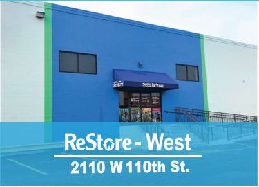
ReStore - West 2110 W 110th St.