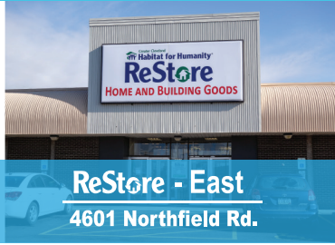
ReStore - East 4601 Northfield Rd.